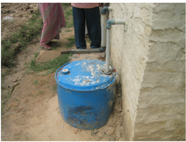
Figure 2: With urine separation one option is to collect the urine so that it can be used as a liquid fertiliser later on.

Compost toilets are often built with two chambers for simplicity of construction and operation. The two chambers are used alternately; decomposition continuing in the full one until it is emptied just prior to the other one becoming full. Each chamber has its own opening for removal of mature, non-odorous compost. Some types of compost toilet batch the waste in movable receptacles on trolleys or turntables whilst others generate the compost slowly and continuously as the material progresses through the device. Some require electricity for small heating elements (in cold climates) or fans (to ensure a positive airflow through the system). Some compost toilets combine the urine and